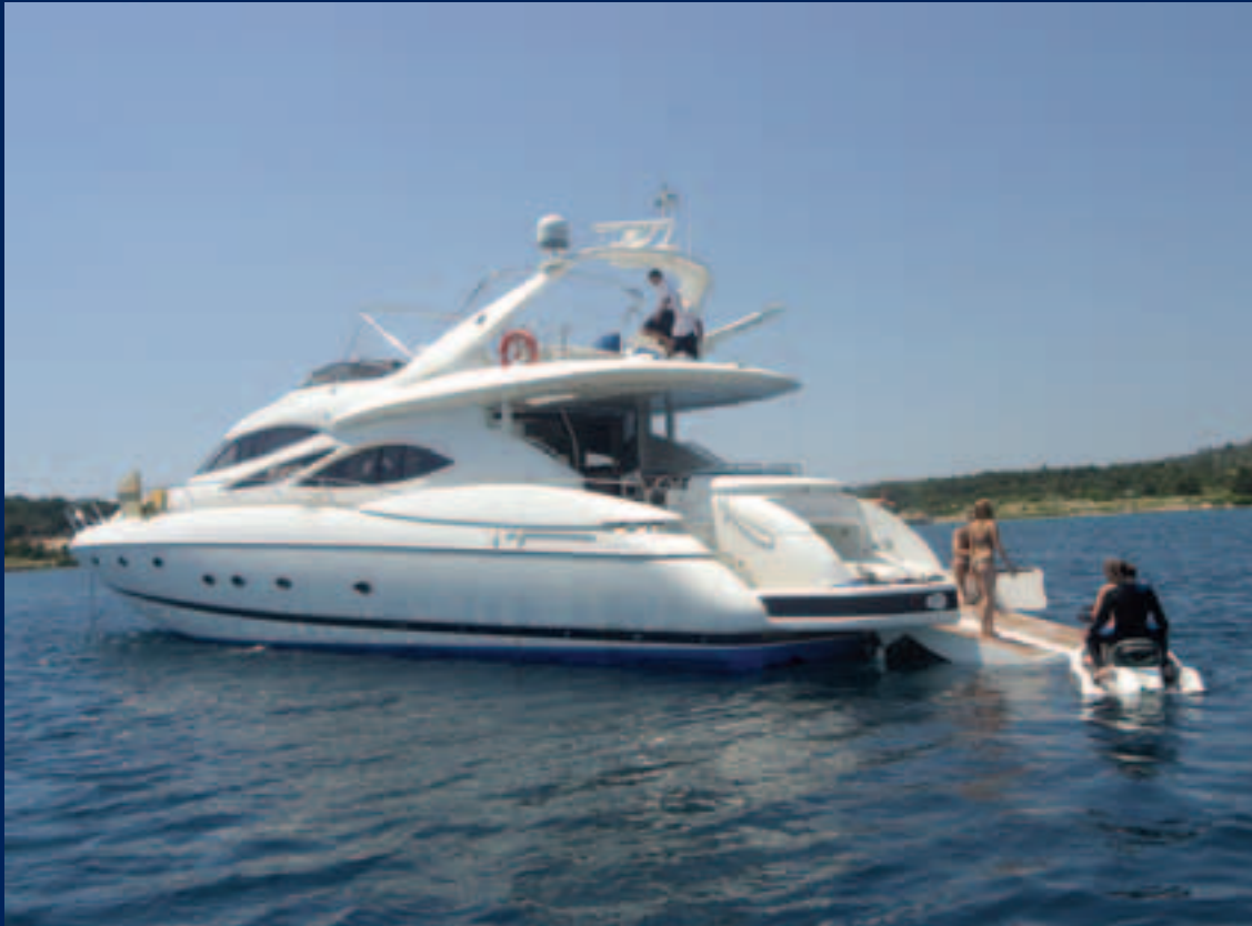
TOYS: The array of water toys and equipment available on the Sunseeker Manhattan 84' will satisfy the most active of guests. Why not try water-skiing, or take yourself off to a secluded beach on the jet rib?