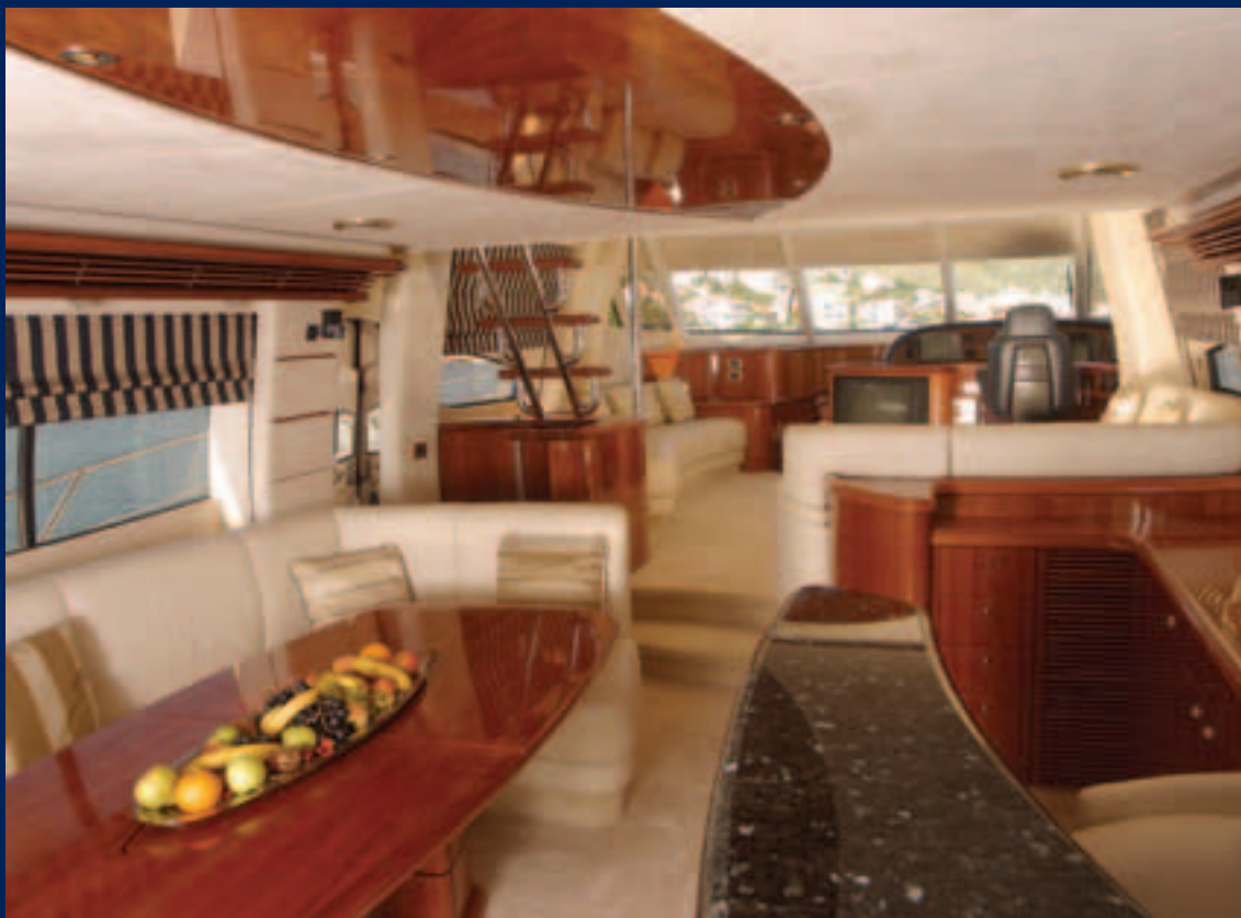
SALON: The spacious Salon, situated on the main deck, is beautifully and elegantly furnished. The dining area allows for the very best of gracious dining, and the leather sofas are so inviting... Corporate hospitality, luxury dining, or simple relaxation - the Sunseeker Manhattan 84's Salon caters for all.