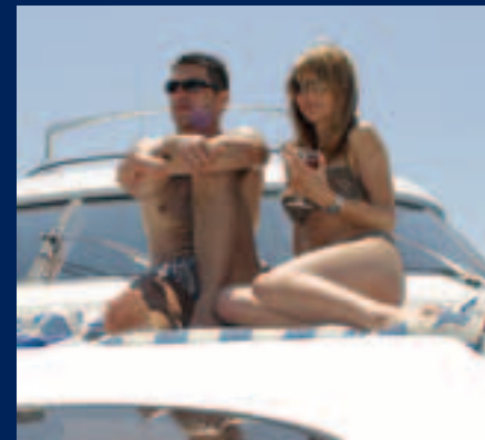
THE FLYBRIDGE: The flybridge is the perfect spot for viewing the dolphins riding the bow. The spacious seating area is ideal for al fresco dining.