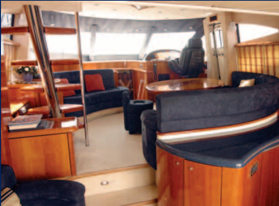
SALON: Spacious salon can easily accommodate six guests who can just relax while listening to the stereo sound system watching their favourite movie on DVD or just enjoying the great view from the boat. Corporate hospitality, luxury dining, or simple relaxation - the Sunseeker Manhattan 64's Salon caters for all.