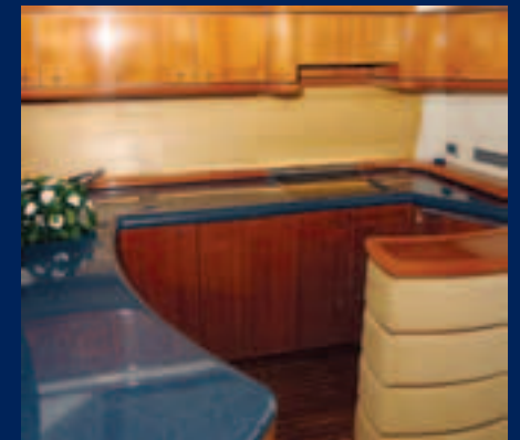
ACCOMMODATION: The interior of the Manhattan 64 is finished in luxurious high gloss cherry wood and chamois leather and comfortably accommodates six guests in three double cabins. Each cabin has it's own ensuite bathroom to ensure complete privacy.