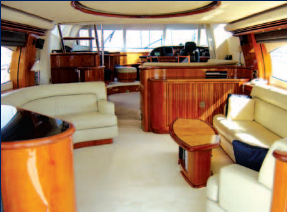
SALON: The spacious Salon, situated on the main deck, is beautifully and elegantly furnished. The dining area allows for the verybest of gracious dining, and the leather sofas are so inviting... Corporate hospitality, luxury dining, or simple relaxation - the Sunseeker Manhattan 80's Salon caters for all.