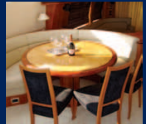
ACCOMMODATION: Whether you charter the Sunseeker Manhattan 80' for a luxury cruise, a weekend break or a corporate event, the accommodation available will delight.