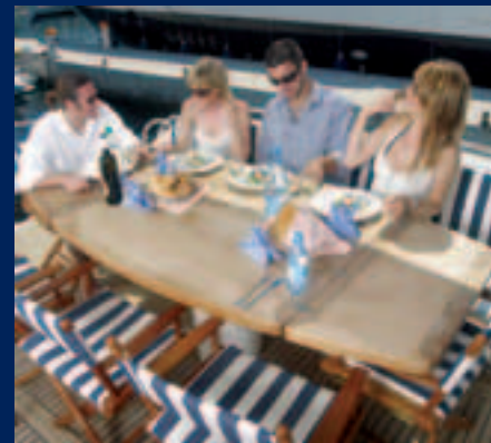
THE FLYBRIDGE: The flybridge is the perfect spot for viewing the dolphins riding the bow. The spacious seating area is ideal for al fresco dining.