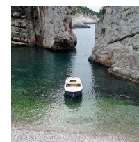
Stiniva Bay, Vis