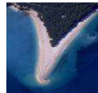
Bol, Golden Cape

Visit to Island of Drvenik, with the surprisingly vivid colors of the sea bottom. Spending night in Trogir, remarkable city on UNESCO World Heritage list, with the most beautiful cathedral in this part of Europe.